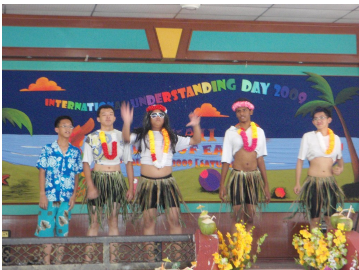
International understanding day at Sekolah Aminudin Baki held on 1st Aug 2009